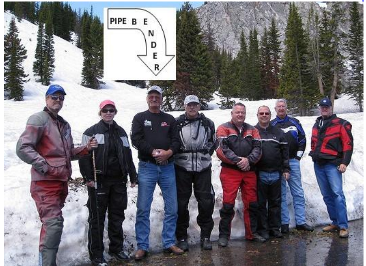
The 2010 Aluminum Butt Riders