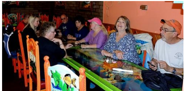
Hovenweep riders enjoy dinner