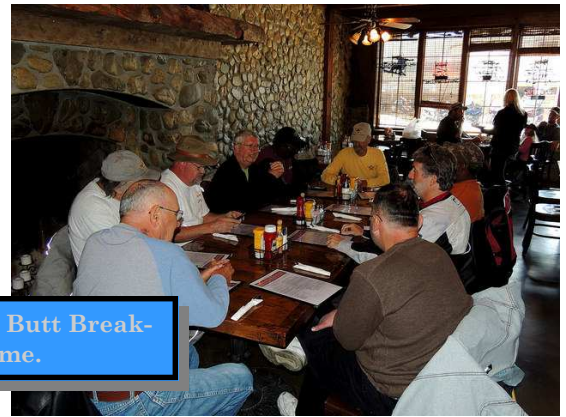
Aluminum Butt Break-time.