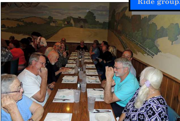
May Dinner Ride group.