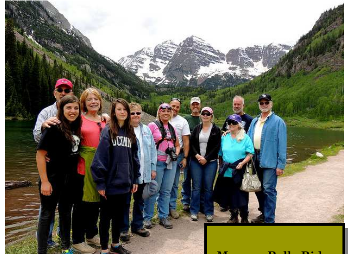
Maroon Bells Ride.