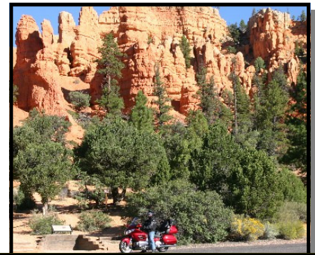
Great Scenery from the Bryce Canyon Ride