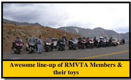
Awesome line-up of RMVTA Members & their toys