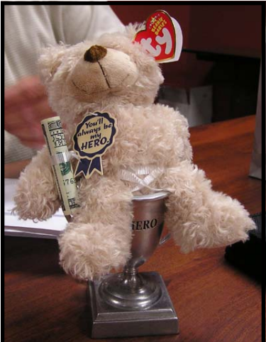
Close-up of Brian's "Super Hero" trophy