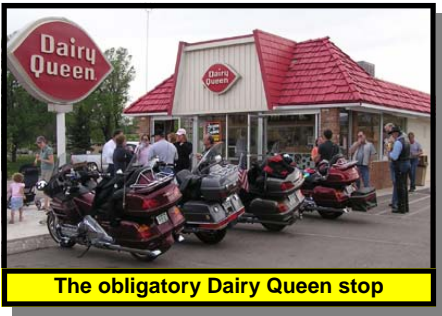
The obligatory Dairy Queen stop