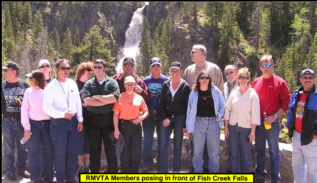
RMVTA Members posing in front of Fish Creek Falls