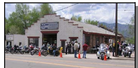
Freewheeler & RMVTA bikes at the Blossom Festival in Canon City