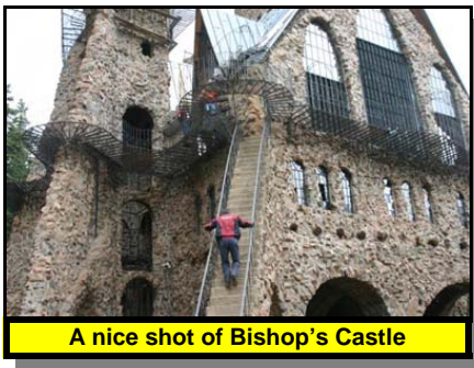
A nice shot of Bishop's Castle

(Please note that there is no Officers Speak this month) (See "Newsletter" in the May Minutes, page 2)