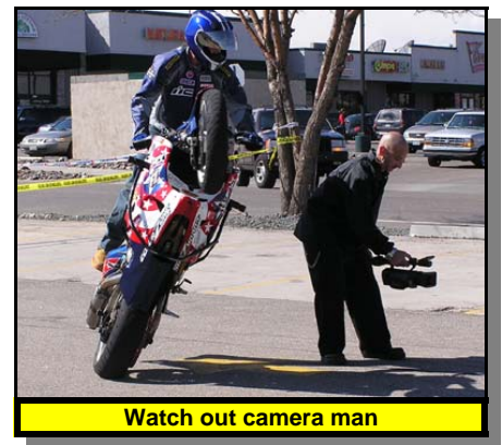
Watch out camera man

A FIRST-grade teacher, Ms. Brooks, was having trouble with one of her students, Harry. The teacher asked, "Harry, what's is bothering you?" Harry answered, "I'm too smart for the 1st grade. My sister is in the 3rd grade and I think I am smarter than she is! I think I should be in the 3rd grade too!"