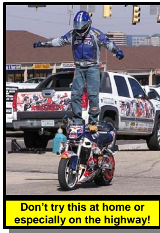
Don't try this at home or especially on the highway!