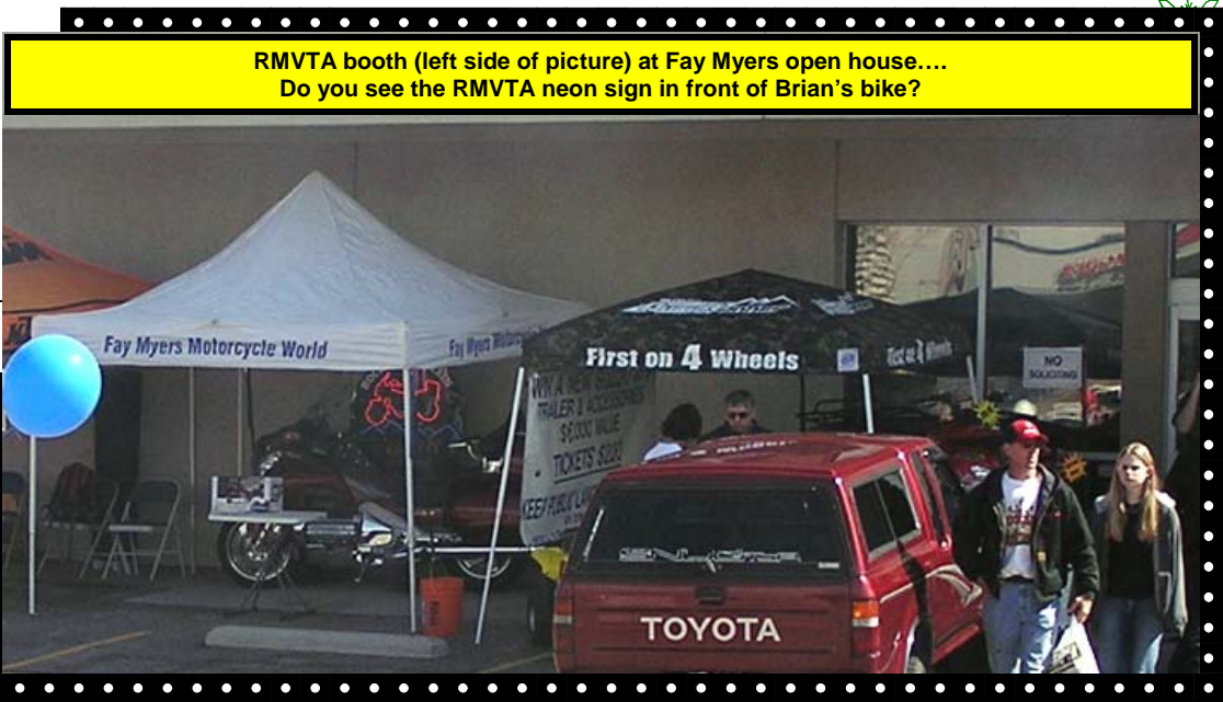
RMVTA booth (left side of picture) at Fay Myers open house.... Do you see the RMVTA neon sign in front of Brian's bike?