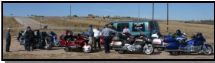
Fall 2004 Hi-way Cleanup

The Deadline for the Next Newsletter is November 23, 2004