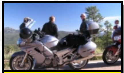
Richard Bush and Stan Stotz stop and smell some roses on the ride following the Fall Highway Clean-up Ride (Stan's new bike)

Saturday we (some of us pretty early to make it that far south) left the house in some pretty brisk temperatures to make our way down to the Pegasus Restaurant in Castle Rock for breakfast before heading out to do our bi-annual highway clean-up effort on a two mile section of Highway #83 south of Franktown. There were not as many folks there as we would have liked but we got after it