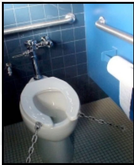
If Women Ruled The World #5