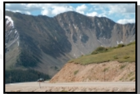
ANOTHER SCENIC MOMENT ON THE LAUGHING LADIES RIDE

Helmets: 1) Shoei Z-11 - medium - full face - pearl white with Goldwing intercom speakers, etc. - bought last summer - paid $450.00 2) HJC open face - Goldwing intercom speakers, etc. - purple - make offer for either or both - Call Mike or Donna at (303) 816-0159