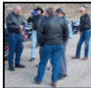
BREAK-TIME ON THE LUNCH WITH THE LAUGHING LADIES RIDE