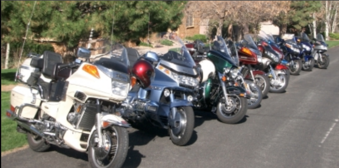
Breakfast gathering at Ron Nardiallo's home prior to the Spring Cleanup Ride