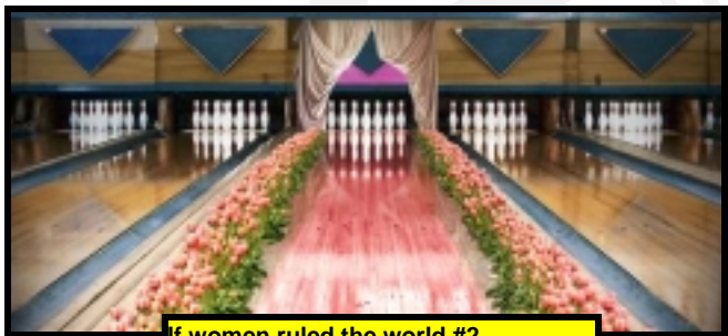
If women ruled the world #2

The Deadline for the Next Newsletter is May 23, 2004