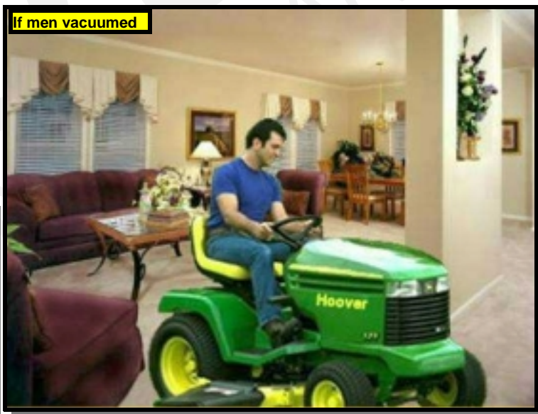
If men vacuumed