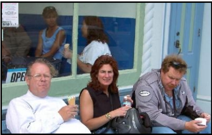
Ice cream time on the To-Hell-U-Ride

These friars were behind on their belfry payments, so they opened up a small florist shop to raise funds. Since everyone liked to buy flowers from the men of God, a rival florist across town thought the competition was unfair. He asked the good fathers to close down, but they would not. He went back and begged the friars to close. They ignored him. So the rival florist hired Hugh MacTaggart, the roughest and most vicious thug in town to "persuade" them to close. Hugh beat up the friars and trashed their store, saying he'd be back if they didn't close up shop. Terrified, they did so, thereby proving that Hugh, and only Hugh, can prevent florist friars.