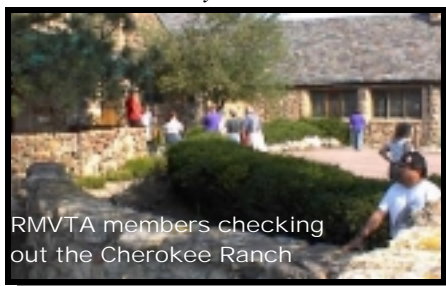
RMVTA members checking out the Cherokee Ranch