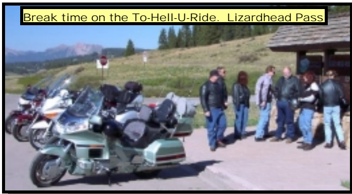
Break time on the To-Hell-U-Ride. Lizardhead Pass