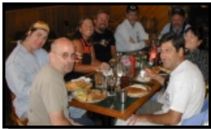
Breakfast at the Pioneer Inn during the Twister Run.

We left for breakfast at the Pioneer Inn in Nederland with 6 bikes and 8 people. We picked up one more rider at breakfast.