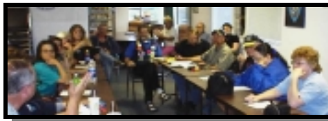
June meeting attendees