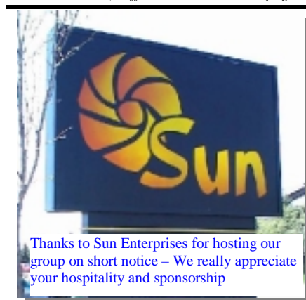
Thanks to Sun Enterprises for hosting our group on short notice - We really appreciate your hospitality and sponsorship

Feb meeting at Sun Enterprises, 8877 N. Washington St., Thornton, February 14, 2002 at 7:30 p.m.