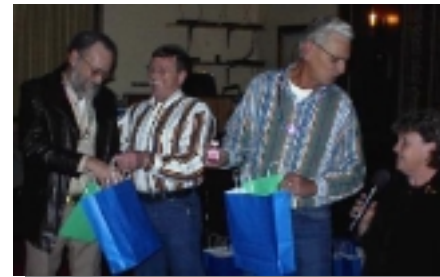
The "3 Tenors" get well-deserved gifts