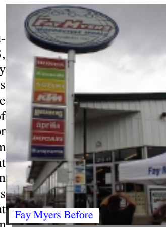
Fay Myers Before

On January 3, 2002 Fay Myers was the victim of a major two-alarm fire that resulted in upwards to an eight million