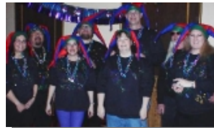
The "Court Jesters"