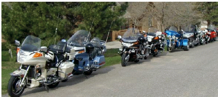
A winning line-up before the annual Highway Clean-Up.