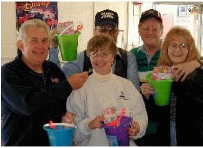
Basket assemblers for the Easter Basket Charity show off their work.

feel like I was just in 4 states.” The trip from here through Naturita, Gateway and on to Clifton where we rejoin 550 is truly one you will not forget. Once back in Grand Junction, we’ll get checked into the Motel 6, relax a bit and then, weather permitting, try for a sunset ride through the Colorado National Monument.