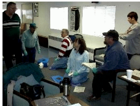
RMVTA Members participate in CPR Training.