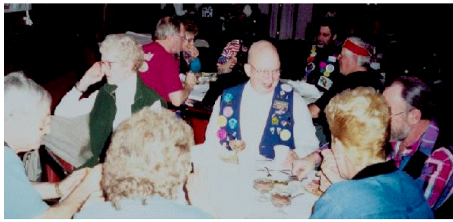
Members enjoy the food and company at the Annual Appreciation party.

Hope to see as many of all of you as possible, it's shaping up to be a lot of fun.