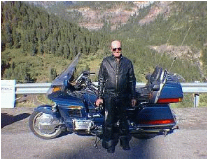
A Very Happy Merle!