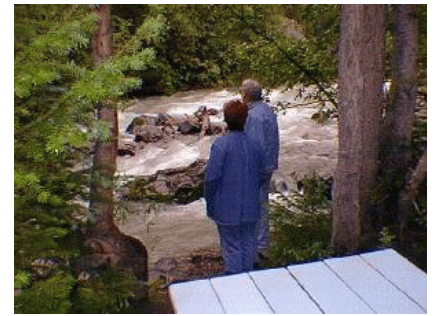
Taking Time to Smell the Flowers.