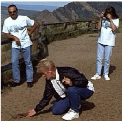
Feeding Friends Creede-Showtime Ride

For those interested, we are planning a membership photo gallery for the web page. Bring your favorite photos to the next meeting, with or without your bike, so we can post them on the web page. We won't include your phone number or address. If all our members send in pictures, we will have an easy way to put names with faces. All pictures will be returned to members. If you don't have a good picture, contact our webmaster Stan Stotz and he will be happy to take a digital picture free of charge