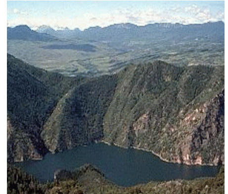
View from Morrow Point Dam Creede-Showtime Ride

Looking forward to seeing everyone at the next meeting or out on the road for a fun ride. Keep the shiny side up, and remember, feelings are everywhere, be kind.