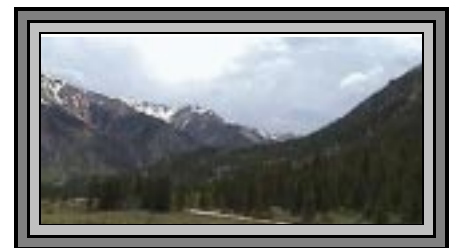
Scene from the Aluminum Butt Ride

As you know, we are fast approaching my due date and I will really rely upon you over the next several months to help me get the newsletter out in time by having your articles in by the deadline. So far, everyone has been really good about this and I thank you for that. There is one area where we are falling behind, however. And that seems to be in receiving information from Ride Captains about the rides they have led. In many ways, this information is just as important as promoting your ride before hand. Why? Well, it lets not only other club members know what they are missing out on by not going on a ride, it also gives people who look at our web site an idea of what our rides are really like. So if you have led a ride and not passed the information on to me, please do so this upcoming month. Consider it the final leg of your ride. Thank you.