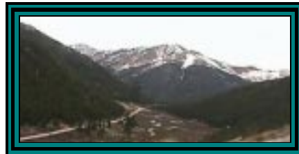
Looking back from Independence Pass - Aluminum Butt Ride

No Ride Updates were received at the time of publication. Everyone must have been too busy riding and having fun to send in reports of rides that you might have missed. Guess, that just means you had to be there.